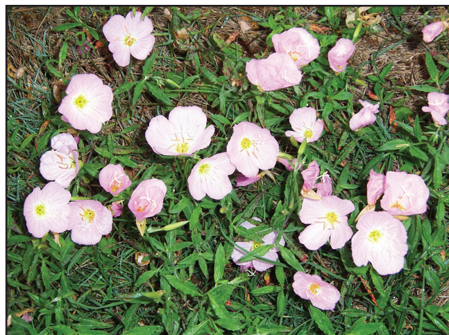
Mexican primrose, a low growing plant, helps maintain the vertical separation of fuels.