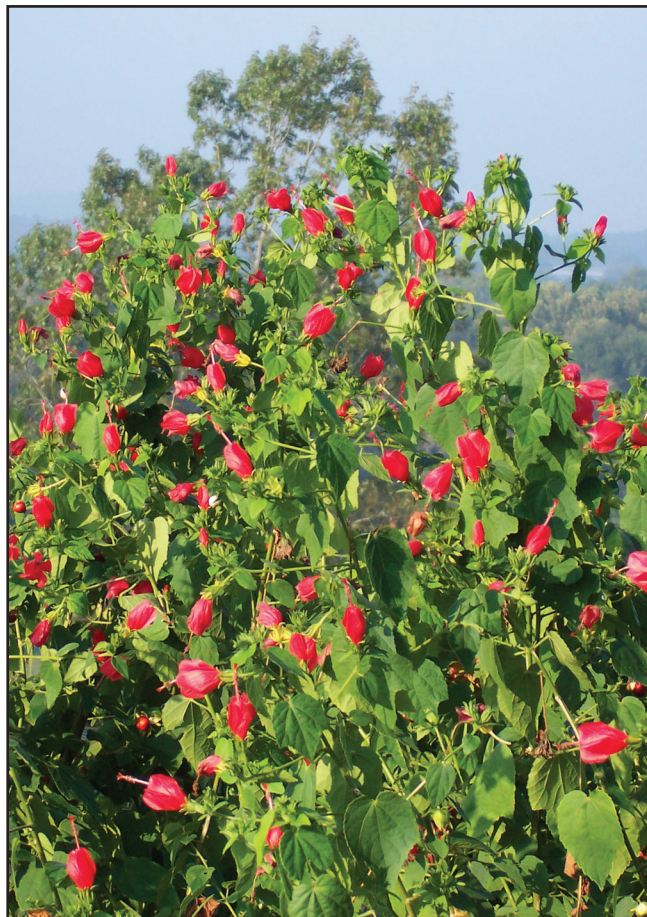
The low oil content of Malavaviscus "Big Momma" makes this plant less flammable.